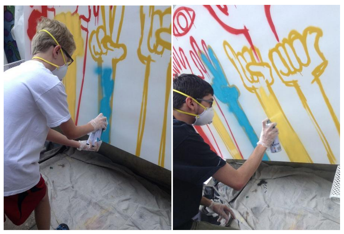
There were four Deaf students who participated in the project.