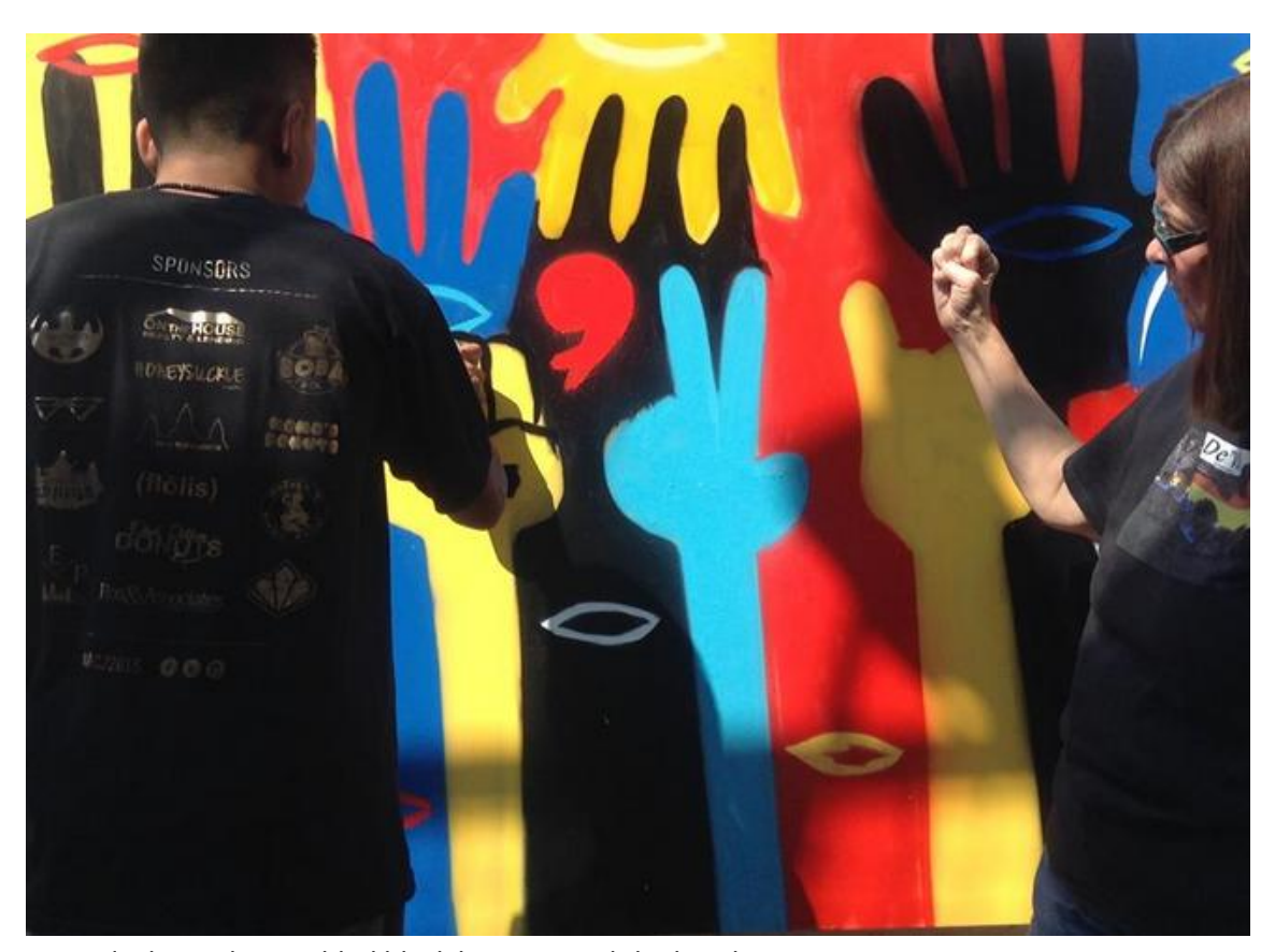
Towards the end, we added black lines around the hands.