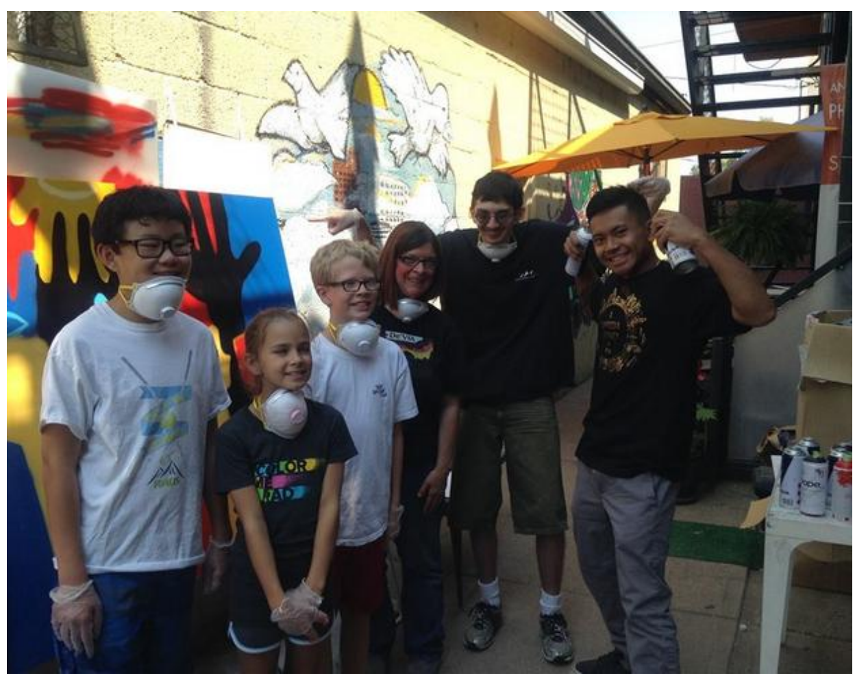
The entire team accomplished the project. Three hours total.