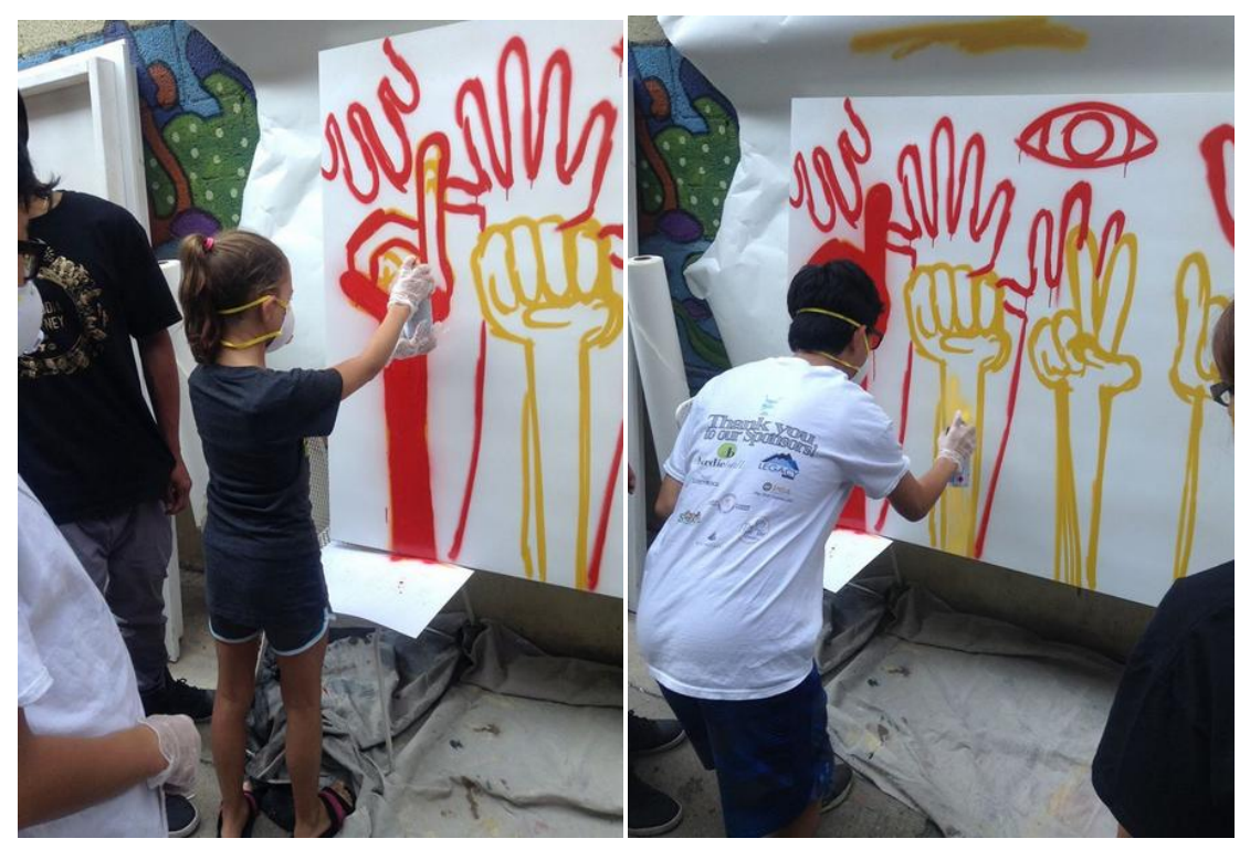
Each student spray painted.