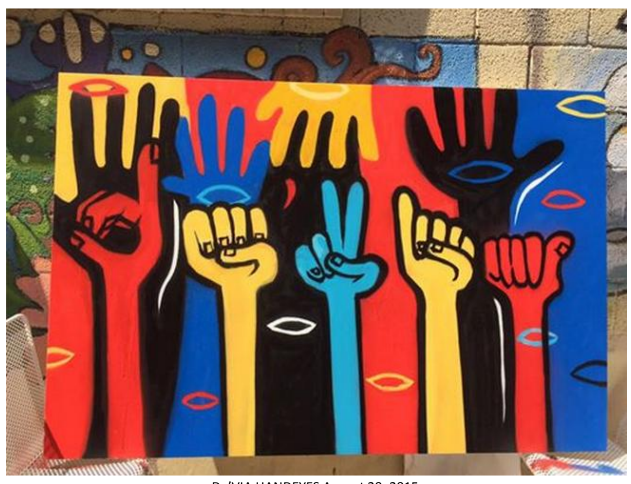
De'VIA HANDEYES August 29, 2015