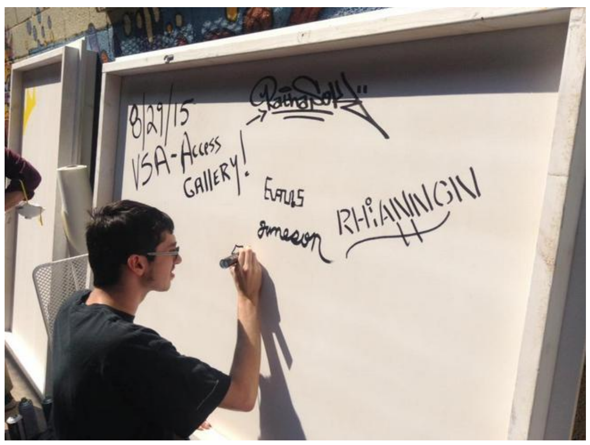
Each of us signed our names on the back of the board. We titled the graffit work "De'VIA HANDEYES."