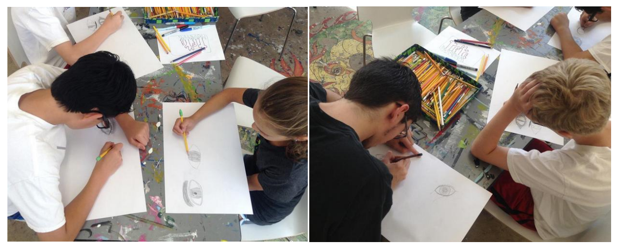
We started off with sketching for ideas for the graffiti work.